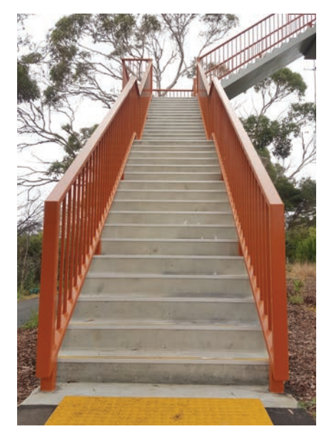
Portland ring road pedestrian overpass