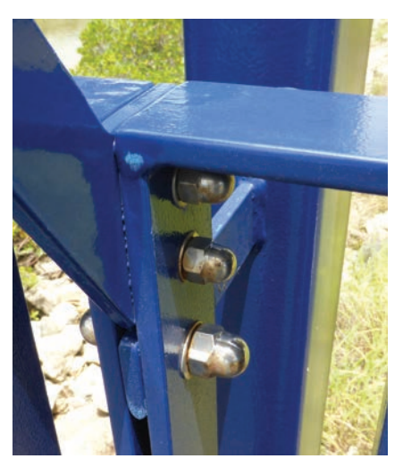
Captains Creek, Townsville, Queensland

Newly hot dip galvanized coatings are normally quenched in an aqueous solution by the hot dip galvanizer to impede early onset of white rust. If a hot dip galvanized article is to be painted, it is usually best to exclude this step from the hot dip galvanizing process to minimise contamination. To ensure the best possible surface for painting, advise the hot dip galvanizer of your needs prior to hot dip galvanizing.