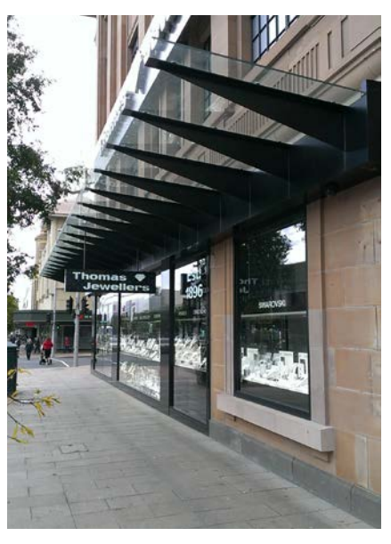
Thomas Jewellers - Outriggers