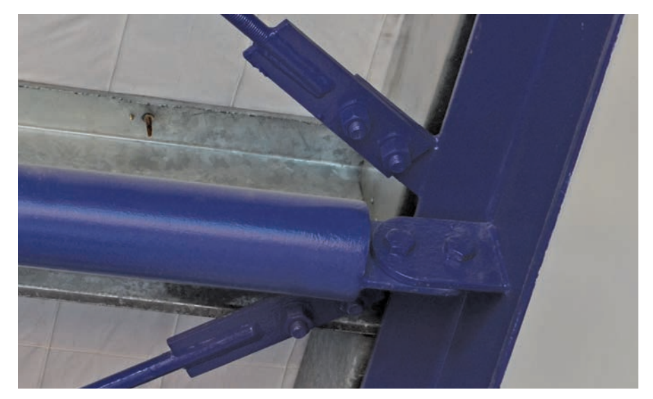
Figure 1: Close-up of some of the duplex coated structural members inside the Queanbeyan, ACT Pool after around eight years' service