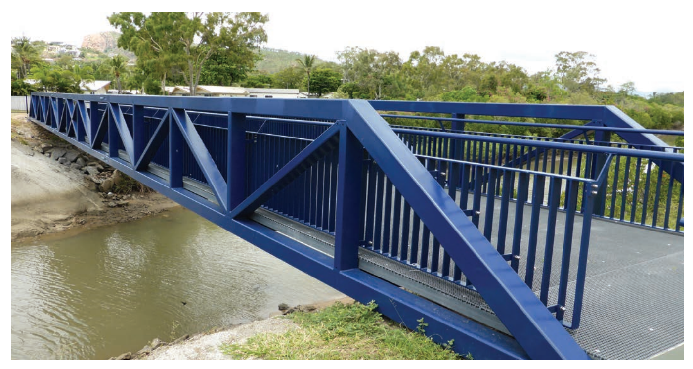
Figure 5: Duplex coated pedestrian bridge located at Captains Creek, Townsville, Queensland

For painting unweathered hot dip galvanizing with conventional low build paints (see Service Requirements 1 & 2) cleaning and degreasing is normally adequate, although light scuffing with sandpaper will invariably enhance paint adhesion. For higher build paints and under conditions of more arduous wear, brush (whip) abrasive blasting is favoured (see Service Requirements 3 to 6).