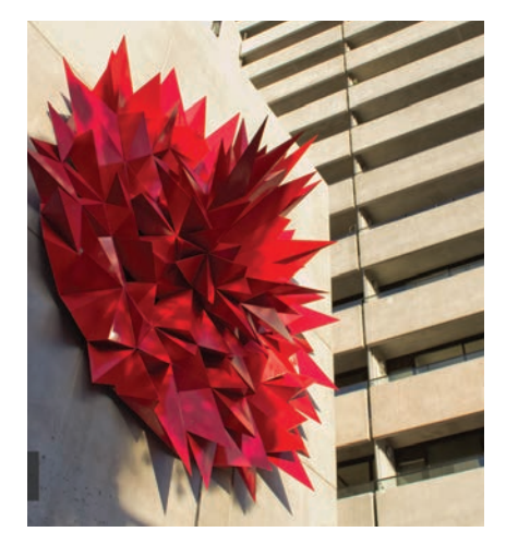
Figure 2: "The Moment" by Damian Vick

The paint systems detailed under Service Conditions 1 and 2, are essentially decorative paint systems.