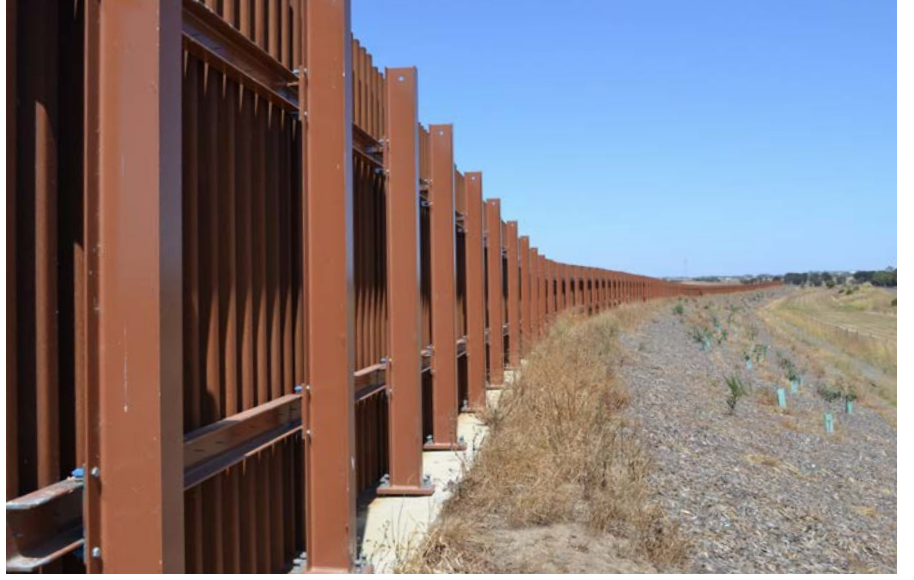
Baanip Boulevard Noise Wall Grovedale