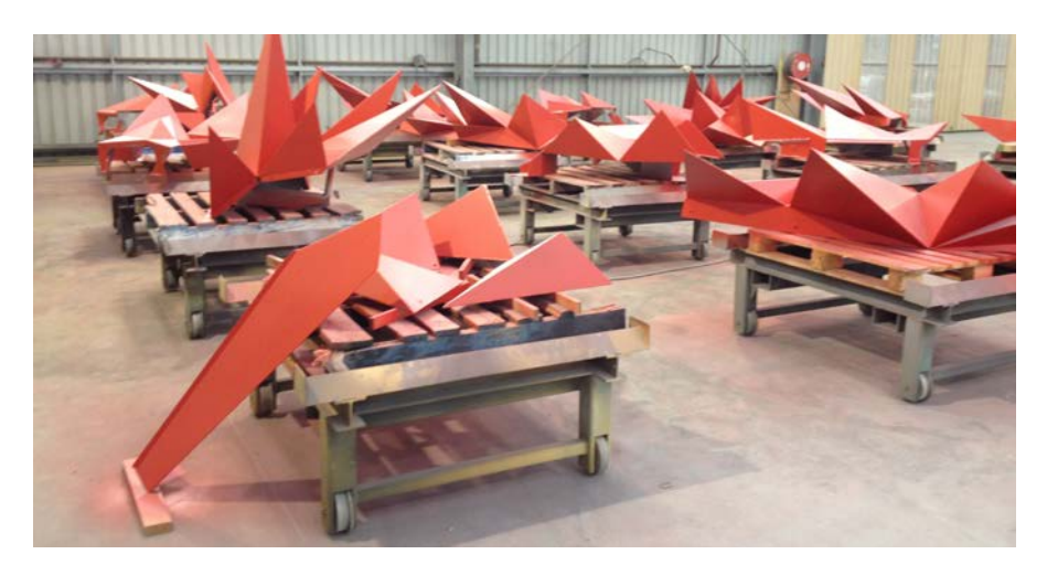
Figure 6: "The Moment", Damian Vick.

Major paint suppliers have provided the GAA with specific product recommendations to meet the Service Requirements in this guide. The supplement Duplex Coatings – Paint Product Guide lists the supplier's products with notes and provides their contact information if further support is required.