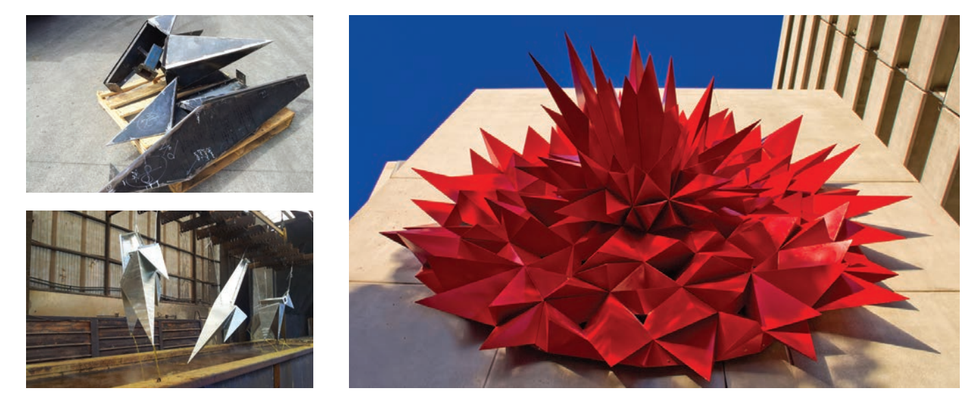
Figure 6: The complex sculptural shapes in "The Moment" meant that only a hot dip galvanized base with an aesthetic top coat would meet to the requirements of the sculptor, Damian Vick.

galvanizing, paint tends to shrink away from sharp edges.